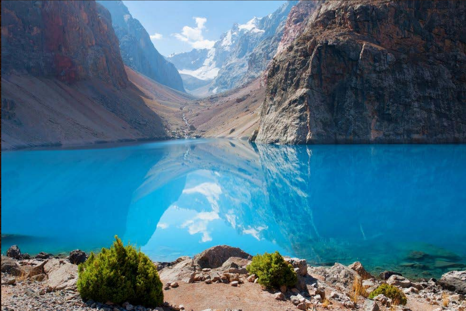
Iskanderkul — Tajikistan