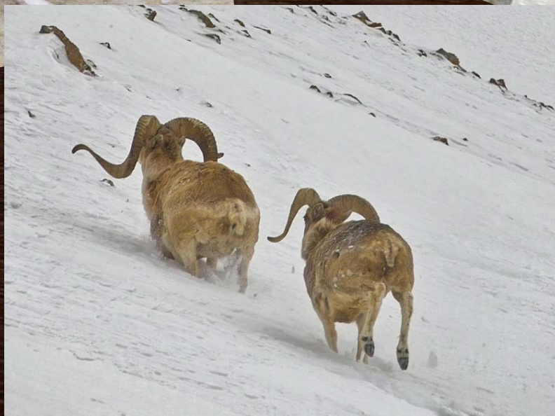
Marco Polo sheep