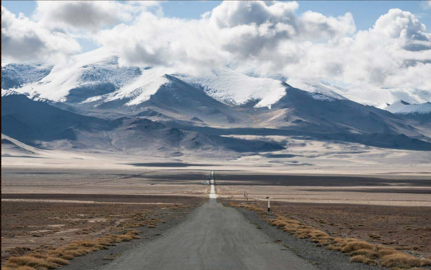
Pamir Highway — Tajikistan